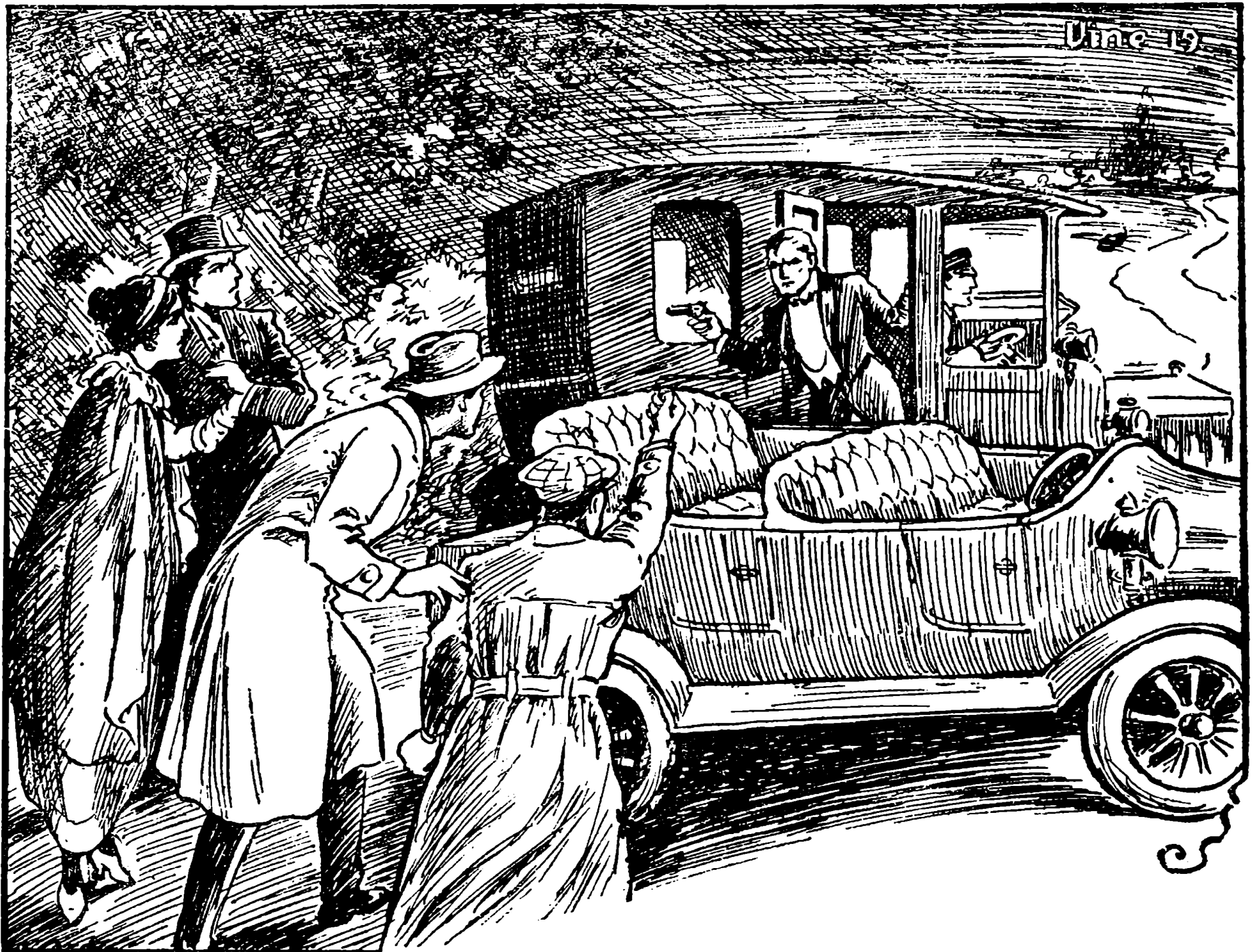
Kennedy uttered a shout of fury and alarm, and a revolver gleamed in his hand. "Stand back!" he exclaimed hoarsely. "Drive on Becker—drive on!"

This was quite satisfactory—so far as it went. Kennedy, according to Tinker, was wearing a moustache now, and this was